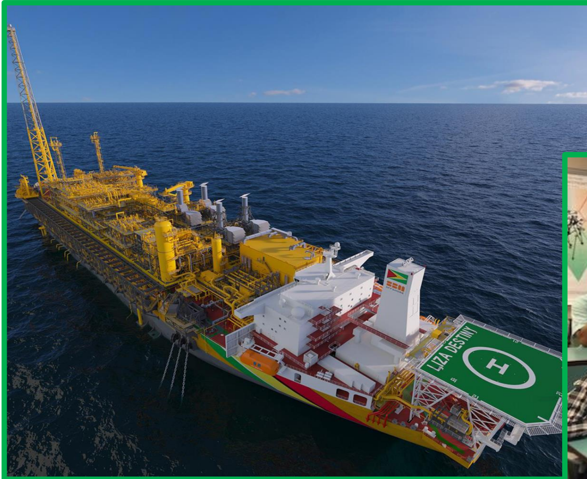
Liza Destiny positioned offshore Guyana

Our first group of Guyanese technicians training to work offshore